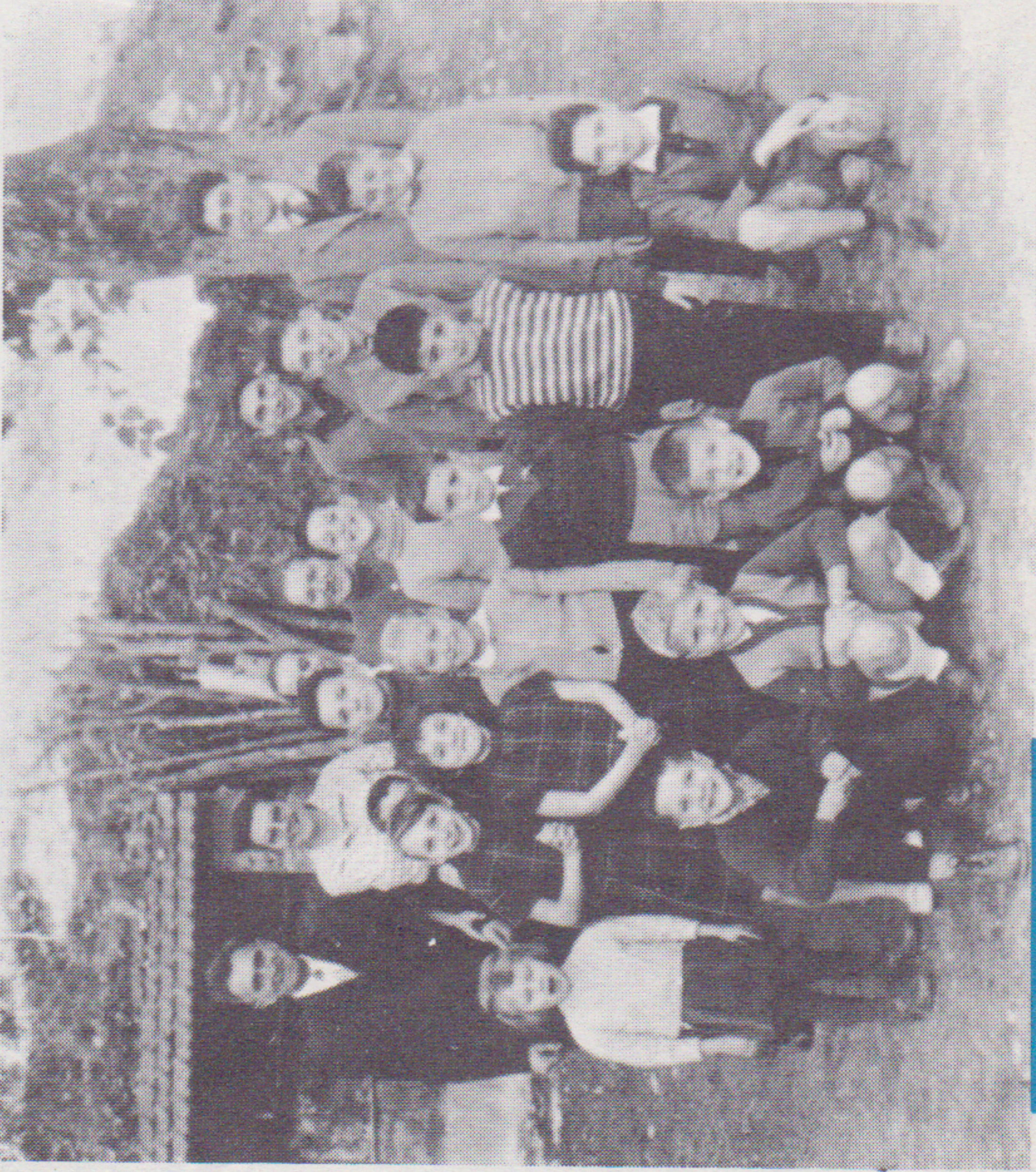
JOUR D'INAUGURATION ET DEDICACE LE 1/11/62